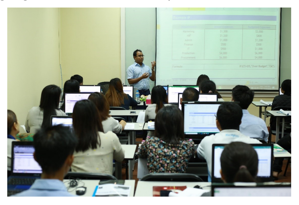
Figure: Advanced Excel Training