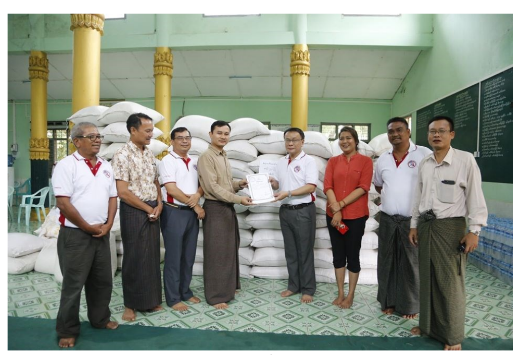
Figure: Food Supplies for Mon State Flood