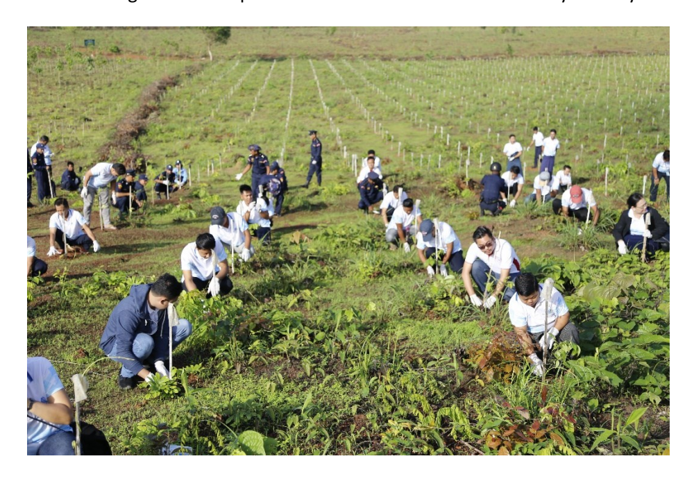
Figure: Planting ceremony in Taikkyi Township

Principle 9 - Encourage the development and diffusion of environmentally friendly technologies.