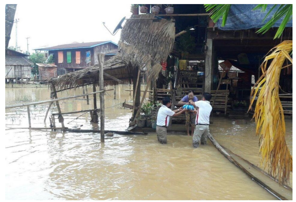
Figure: Donation activity for the flood in Mon State